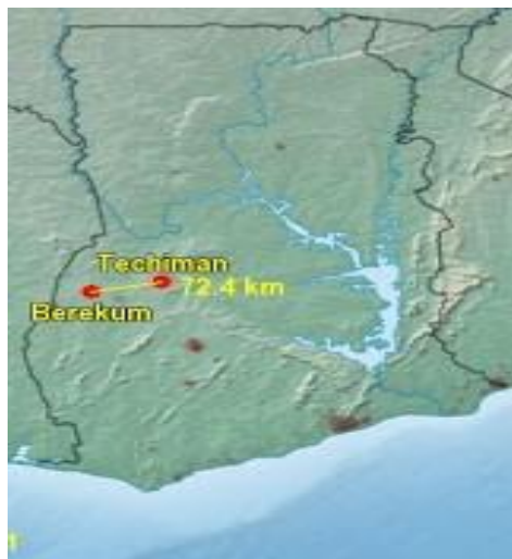
Figure 1: The location of Berekum on the map of Ghana.

The study population consisted of parents seeking healthcare for their children at the Holy Family Hospital, in Berekum. This hospital was selected purposefully for the study because it is the largest referral center in the municipality and access to eligible study participants was relatively easier.