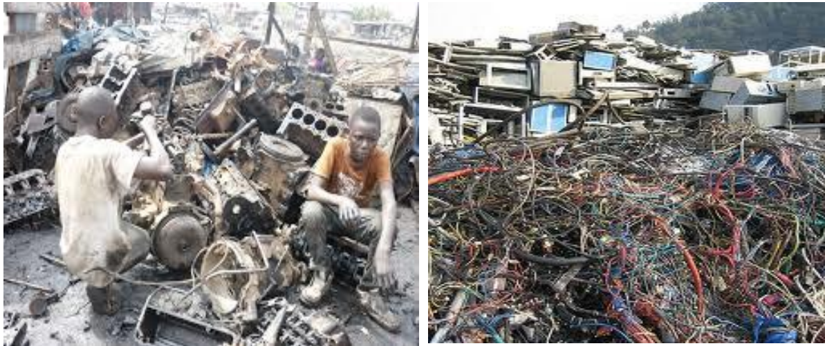
Fig 2: (A) Scavenged scrap metals (B) Scavenged e-waste materials

by Grant and Oteng-Ababio (2011). Significantly, they do not pay tax on their income, a situation that needs to be re-examined by policy makers in Ghana. But even with the immense potential as a livelihood opportunity, waste scavenging is fraught with adverse health hazards. This is what the subsequent section seeks to explore.