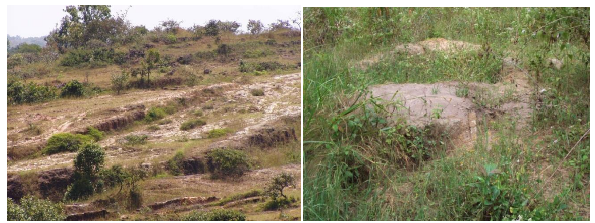
Pictures 1 and 2: (1 Left) Trench remains; (2 Right) Holes and pits covered with grass

On the other hand, a very intense alteration of rock (granite) that has rendered the soil material very fragile and unstable could be observed creating a favorable for a landslide to occur. Water erosion has also been noted since the colonial period (period of exploitation) and is not without negative consequences (ROOSE et al; 1973 ). Leaching causes mineralization in stream sediments; the surface waters thus often have more or less important concentrations of tin (Tn). The downstream area used by surrounding populations represents a major risk for the development of cancerous diseases and many others. More so, after mining operations, the landscape is left with huge, gaping pits, which disfigure the landscape.