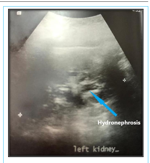
Plate 3: An ultrasound scan of the left kidney at 2 mos postintervention showing mild hydronephrosis

Abdominal and pelvic ultrasonography detects the hydronephrosis which is confirmed with CT scan with CT -IVU [5]. These imaging modalities helped confirm the diagnosis in this case. Magnetic resonance imaging with urography is preferred in the setting of renal impairment [5]. In the presence of associated urinary tract infection, urine analysis, bacteria culture, and antibiotic sensitivity test will help direct the appropriate antibiotics to use. In this case, the urine culture did not grow any organisms and the blood urea and creatinine were normal. Cystoscopy