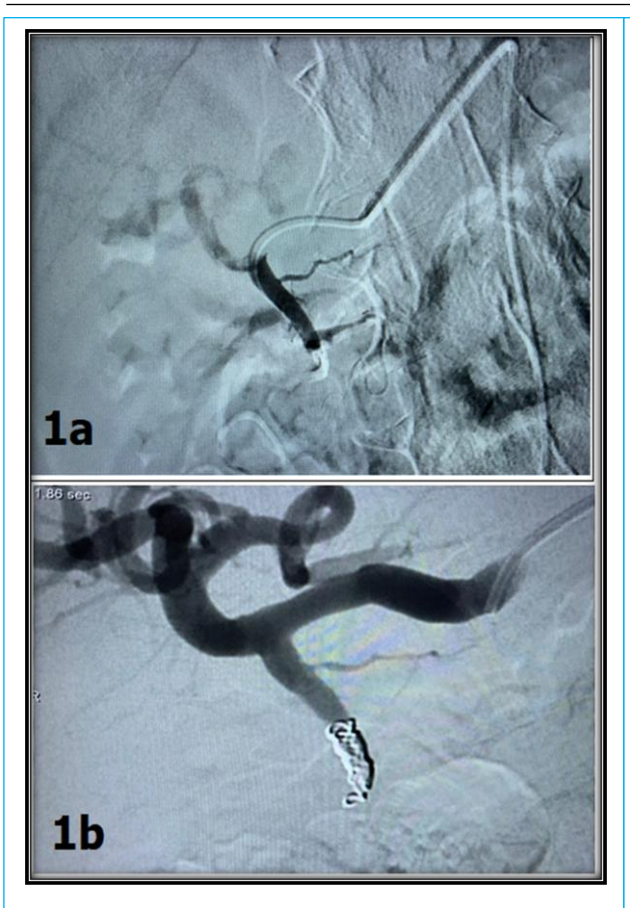
Plate 1: Digital subtraction angiogram (DSA) image with C2 cobra catheter (1a) and post embolization DSA image with catheter (1b) in the common hepatic artery.