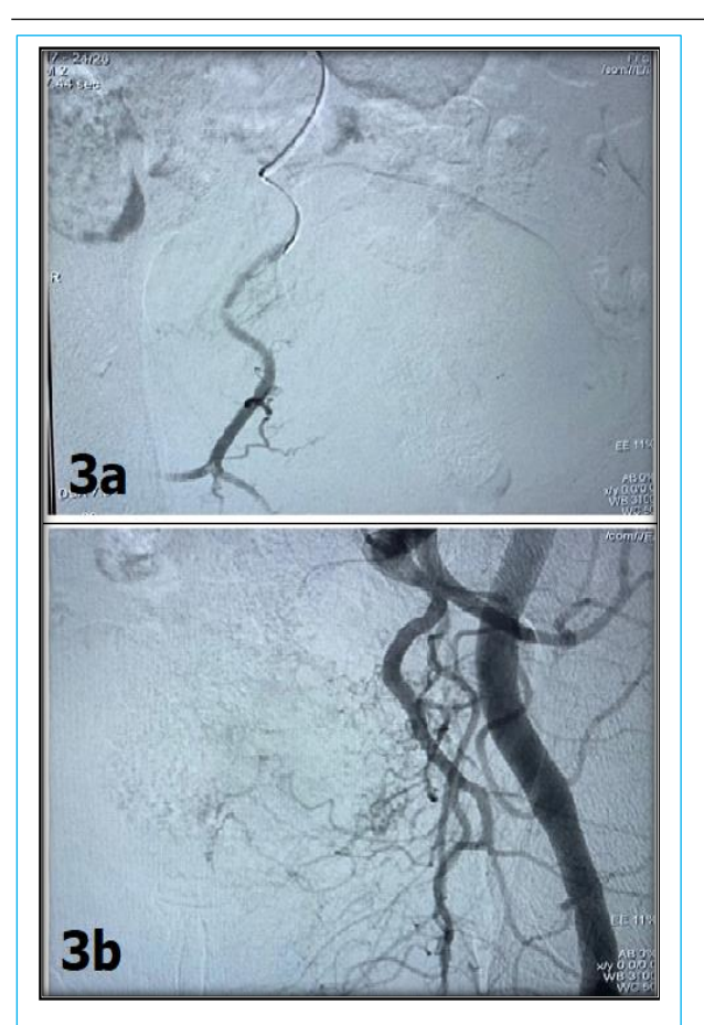
Plate 3: Digital Subtraction Angiogram image of the (3a) right internal iliac artery and (3b) left internal iliac artery. Both images show marked reduction in tumour blush

haematuria. His laboratory parameters included haemoglobin (7.0 g/dL), platelet (197 n/L), estimated glomerular filtration rate eGFR (69 mL/min), and Urea (4.4 mmol/L). He had received a total of 20 units of packed cells prior to embolization over a period of 8 weeks. The DSA of both in both left and right internal iliac artery revealed an extensive tumour blush in the vesical artery territories preembolization (Plate 2).