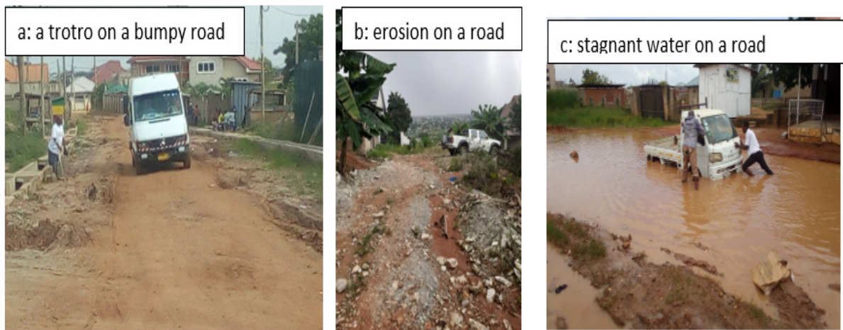
Figure 3 Nature of roads in Peri-urban Areas in New Legon Hills and Windy Hills