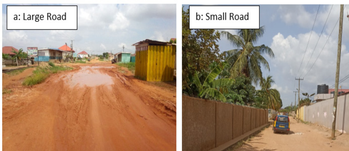
Figure 2 Size of roads in some parts of Adentan

On some of the large roads, pedestrians and motorcyclists are able to navigate them even if vehicles are not, because the inundation or erosion may not cover the entire width, and these are lighter modes of transport and may not