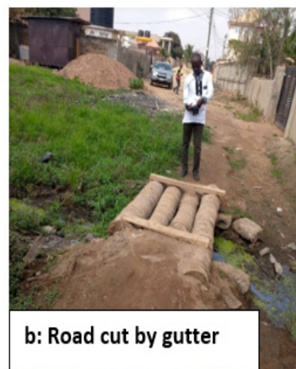
Figure 4 Roads with makeshift bridges at New Legon and New Legon Hills